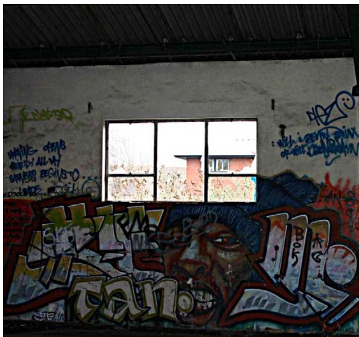
© Paul Rees 2007: Crack House Through the window you can see the Probation Office

Your use of this publication, which is © copyright Support Solutions Ltd 2007 except where identified otherwise, is subject to a Creative Commons Licence that you can view here