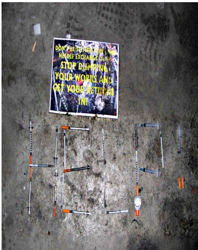
© Paul Rees 2007: Help! Discarded "works" (syringes & needles)